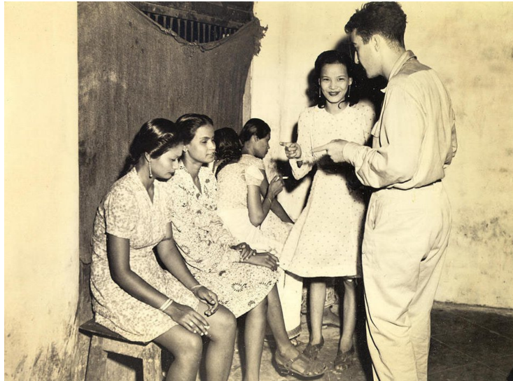
Figure 1: American GI soliciting prostitution in Calcutta (Waddell)

There is also a huge number of prostitutes that are bought into the field forcefully, often as a child. The Commercial Sexual Exploitation of women and children generates approximately 2,560 crore rupees annually in the city of Mumbai alone. ( Commercial Sexual Exploitation of Children in Mumbai ) There are 1.5 Million child prostitutes in India, some of which are kept in cages. (Jensen)